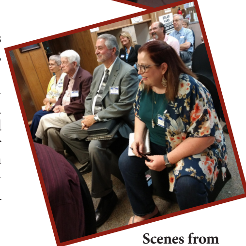
Scenes from ActsFest 2021.