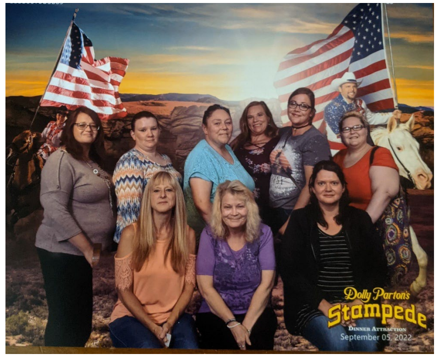
Marchia and the Ladies of Clean Sweep Ministries